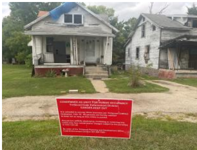
West Third Street

Following are before and after pictures of 3 of the Round 1 demolitions. Due to the rain and mud at the time of picture taking, these sites are awaiting the final lot grading and hydroseeding